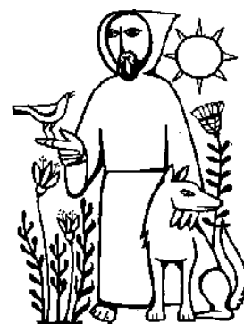
St. Francis, pray for us

Calling all animals! Those with fur, fins, tails and scales are invited to breathe free for the blessing of the animals on the Feast Day of St. Francis of Assisi. We will gather in the church for a service which celebrates the companionship and love God shows us through creation and our animal friends. Please know that stuffed animals are also welcome for a blessing!