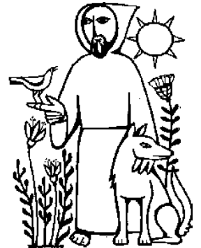
St. Francis, pray for us

Calling all animals! Those with fur, fins, tails and scales are invited to breathe free for the blessing of the animals on the Feast Day of St. Francis of Assisi. We will gather in the church for a service which celebrates the companionship and love God shows us through creation and our animal friends. Please know that stuffed animals are also welcome for a blessing!